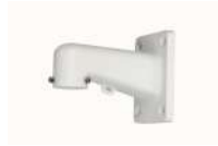
DH-PFB305W Wall mount bracket